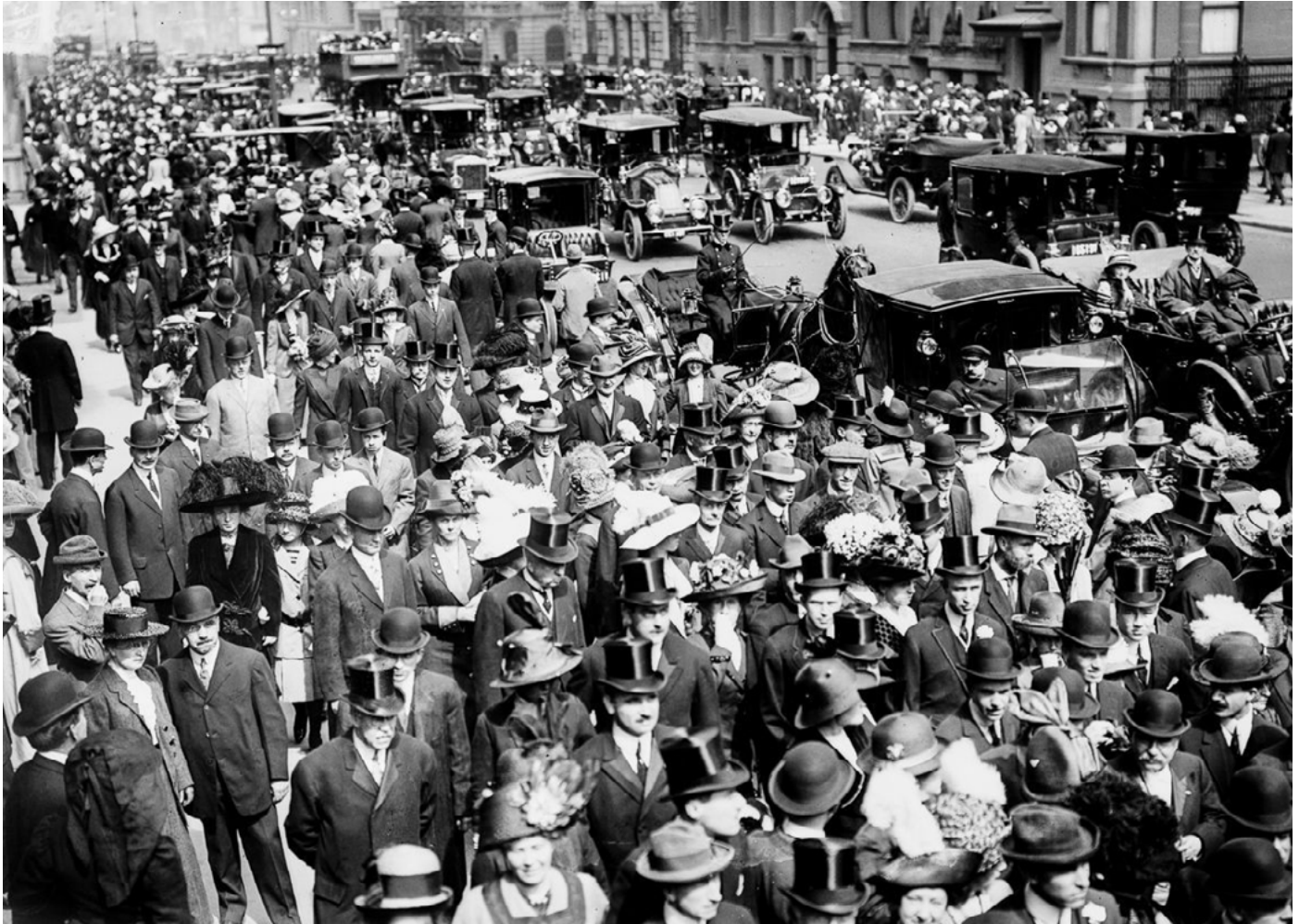
Figure 2: New York's Easter Parade, 1912