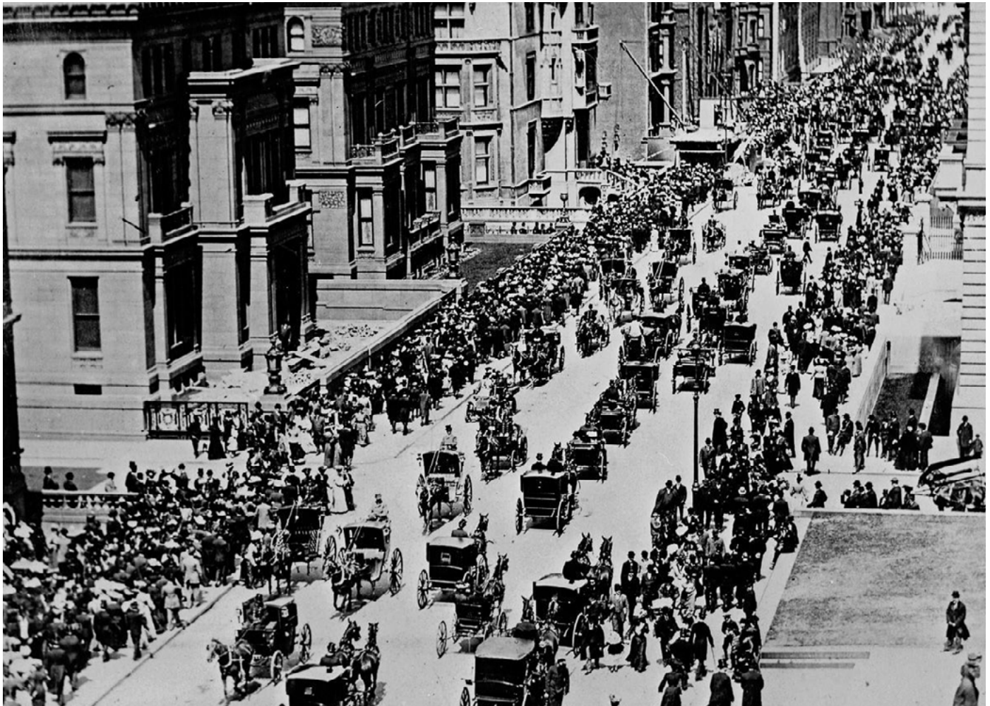
Figure 1: New York’s Easter Parade, 1900

According to industry statistics, consumers purchased almost 200,000 electric vehicles (EVs) 1 in the United States in 2017 – the most ever by roughly 55,000 vehicles. Yet, as a percentage, this figure still only represents about one percent of total light vehicle sales in the U.S.